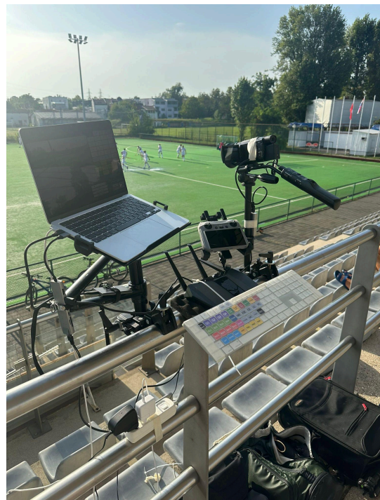
Fig 1: this is an advanced set-up for filming matches

An excellent starting point for clubs new to video. It requires more effort but offers great learning opportunities, especially if the club has volunteers available to film. HCO and RWW have this setup in place already